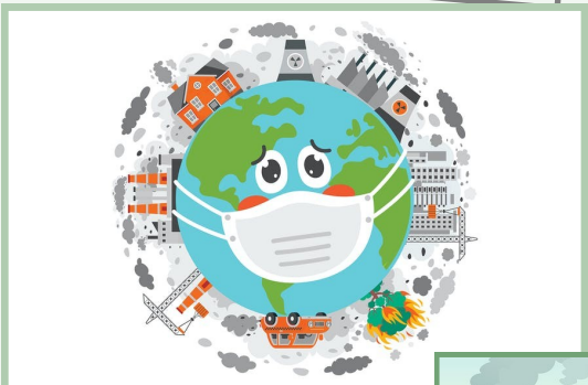
Global Greenhouse Gas Emissions by Gas

Many oil companies, politicians, and large corporations often urge people to "do their part" to fight climate change. This puts the responsibility on individuals to save the environment rather than where it belongs — on them.